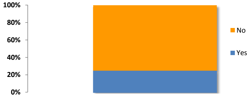
% Planning Institutional Education